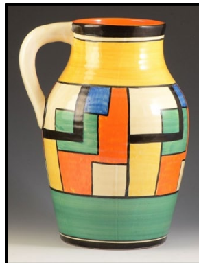
De Stijl inspired