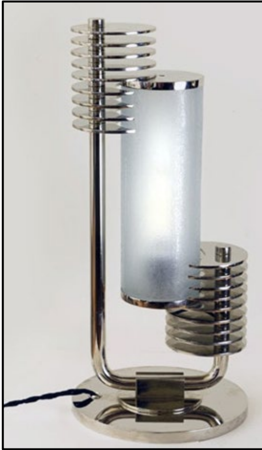
FIGURE H: Modernist table lamp (2) by Edgar Brandt (France), circa 1931.