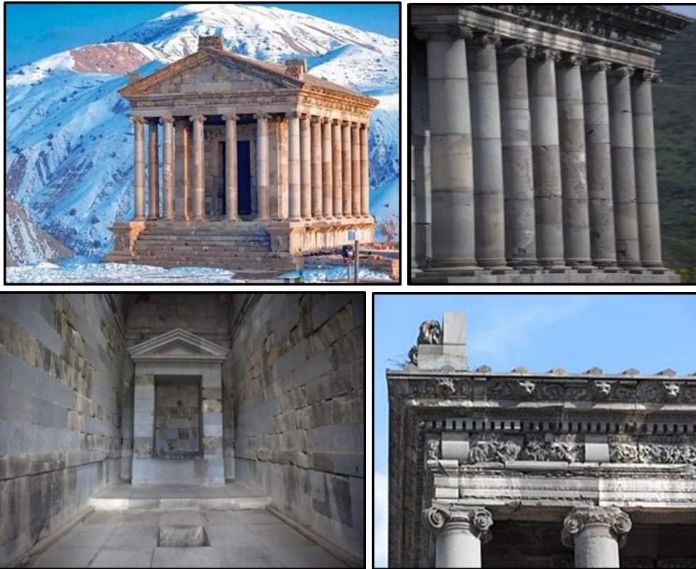
FIGURE F: Garni Temple dedicated to the sun god Mihr, commissioned by King Tiridates I (Armenia), 70–80 CE.