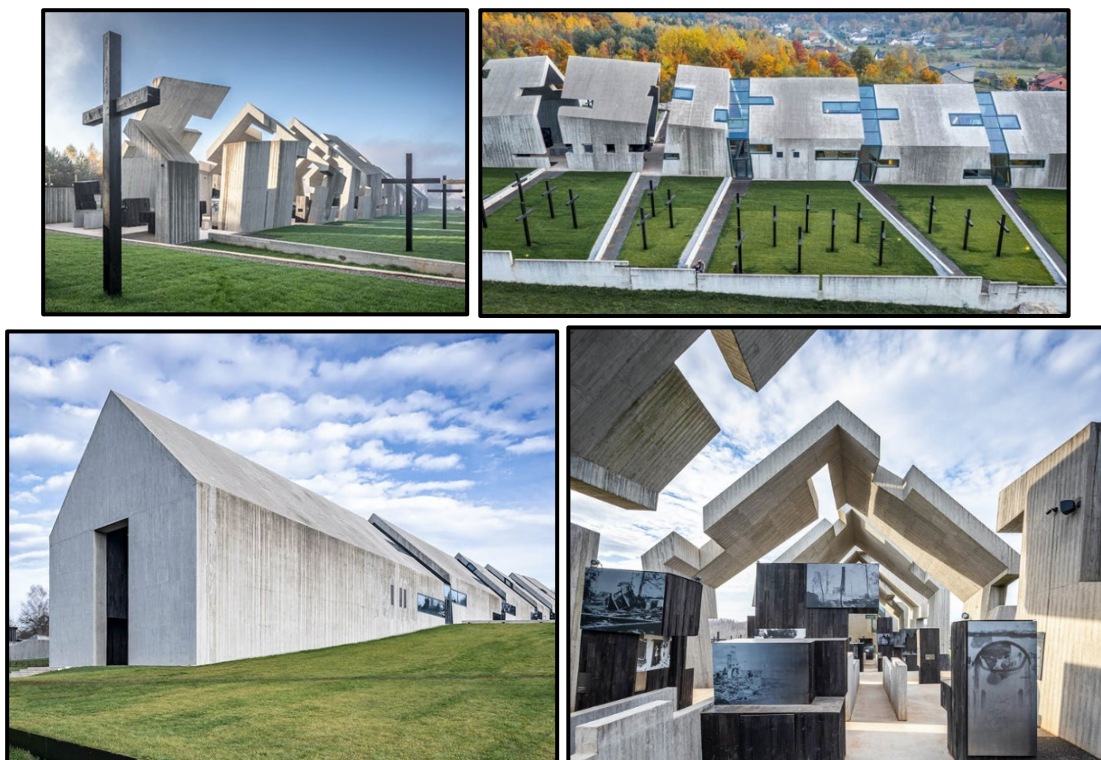
FIGURE G: The Mausoleum of the Martyrdom of Polish Villages in Michniów commemorates the massacre of the inhabitants of Michniów by German forces in 1943 during World War II, by Nizio Design International (Poland), 2009.