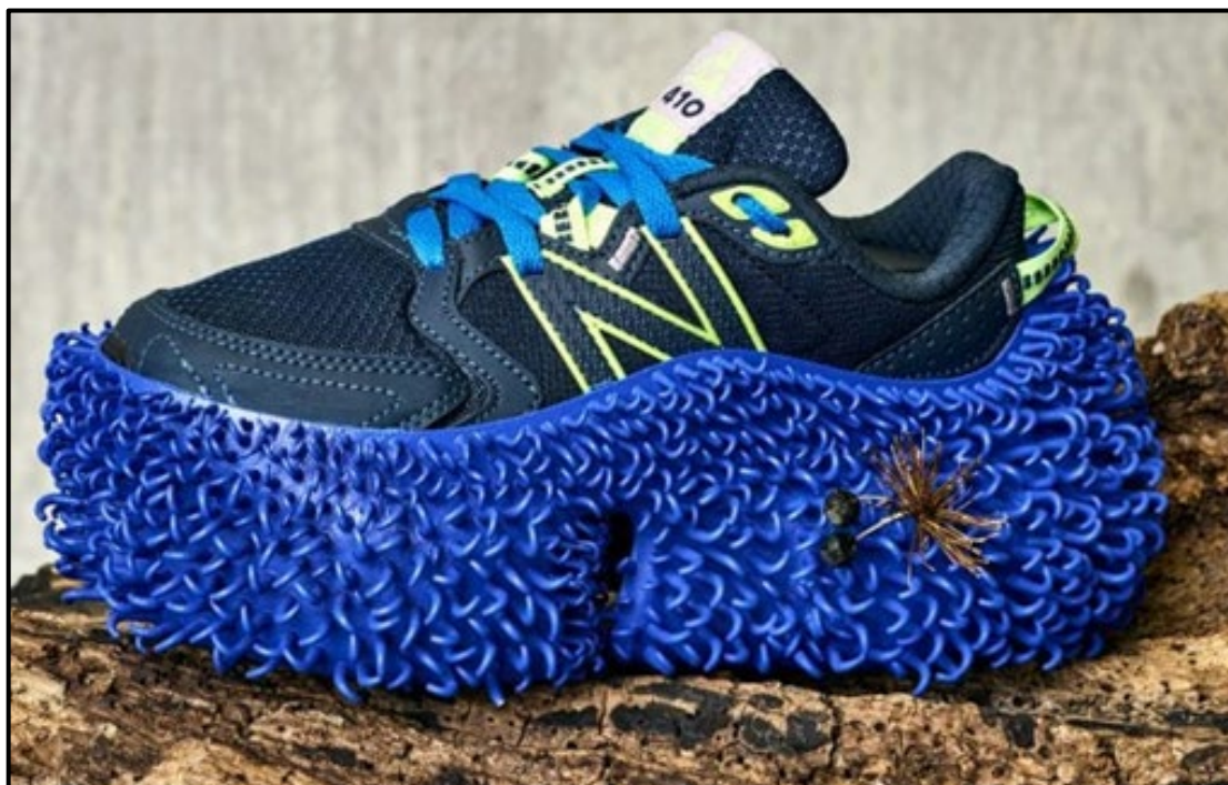
FIGURE L: Rewilding Sneaker by Kiki Grammatopoulos (Greece), 2023.

The sneaker design above scatters seeds while being walked in. The design is influenced by the process of furry animals that disperse seeds as they move through the veld.