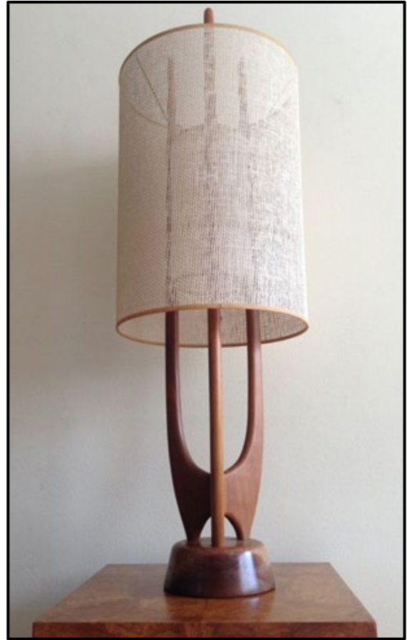
FIGURE I: Scandinavian table lamp by VH Woolums (Denmark), 1960.

Write an essay (at least ONE page) in which you compare the table lamps in FIGURE H and FIGURE I above and explain why they are typical of the movements they represent.