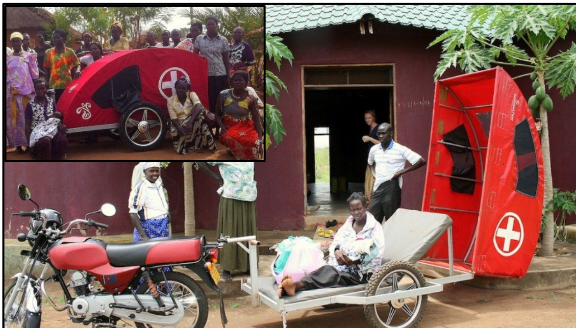
FIGURE J: Zambulance by Zambikes (Zambia), 2015.

5.1.1 Discuss the social benefits and design aesthetics of the Zambulance design in FIGURE J above. (4)