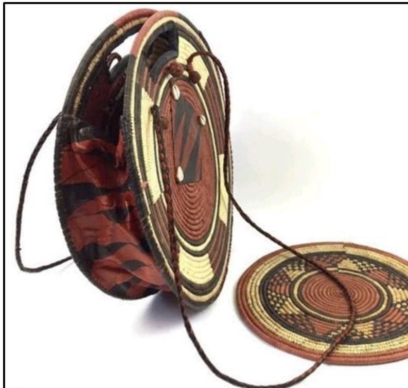
FIGURE E: Hausa tribal bag (Nigeria), circa 1960.

Write a paragraph in which you compare the bag in FIGURE D with the bag in FIGURE E.