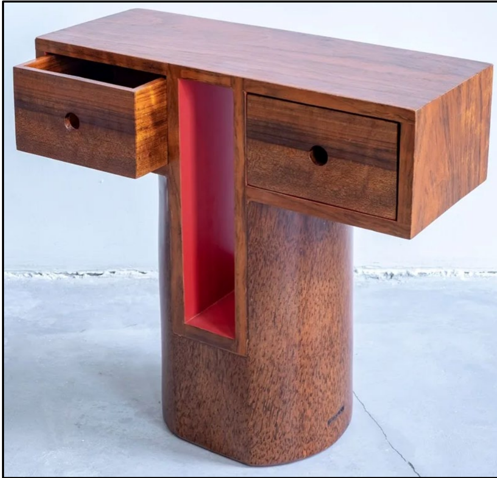
FIGURE B: Accessory furniture by Jean Servais Somian (Ivory Coast), 2019.

Analyse the design in FIGURE B by referring to the following: