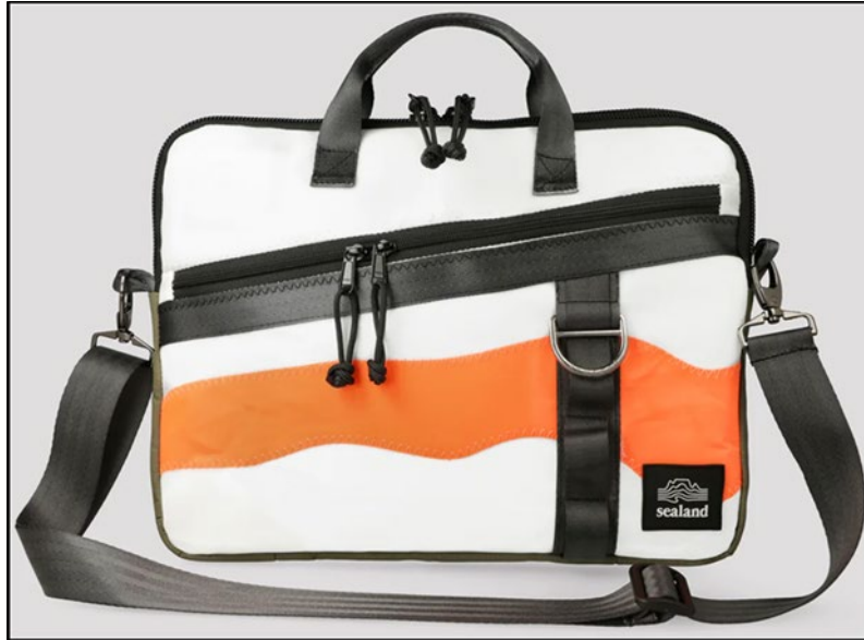
FIGURE D: Laptop bag by Sealandgear (South Africa), 2022.