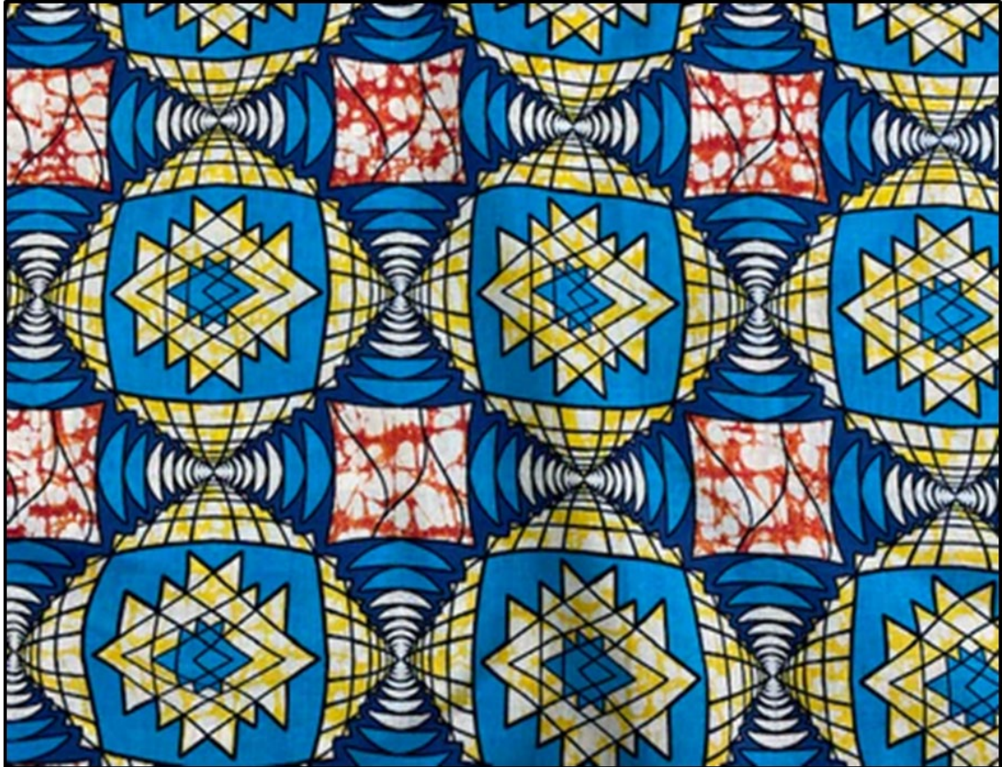
FIGURE A: African cotton print by African Sonic (Nigeria), 2021.

Analyse the use of the following elements and principles in FIGURE A above: