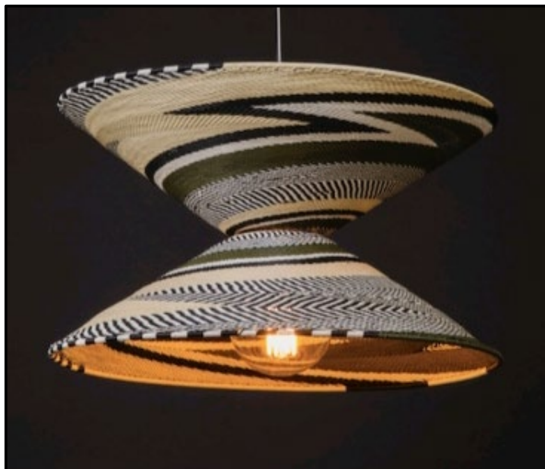
FIGURE K: Pendant light by Mash T Design Studios (South Africa), 2022.